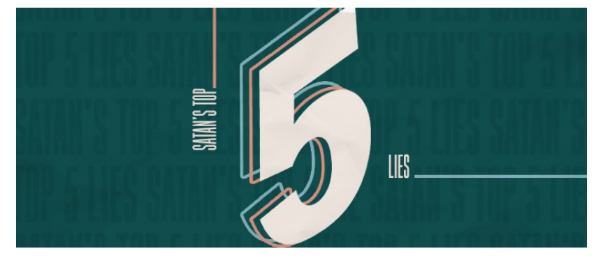
Lie #2 Divorce and Blended Families are Cursed May 29-30, 2021